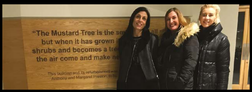
The PJK team volunteer at a Homeless Charity