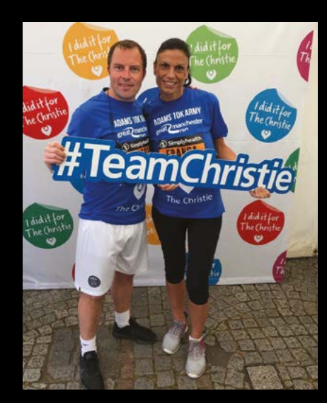
10k Manchester Run

of our teams is a real asset enabling our clients to liaise with the same individuals year after year.