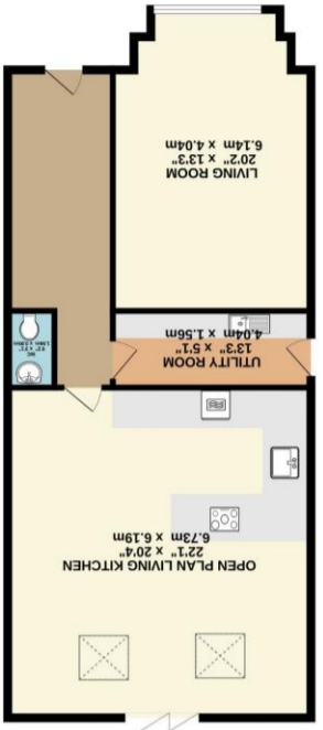
GROUND FLOOR 908 sq.ft. (84.4 sq.m.) approx.