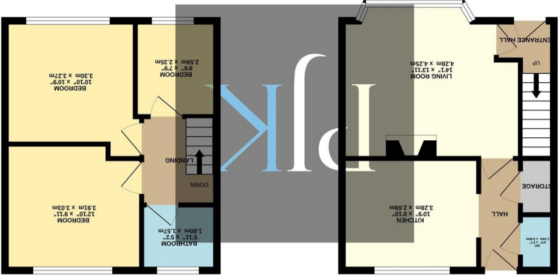
GROUND FLOOR : 414 sq.ft. (38.5 sq.m.) approx. 1ST FLOOR : 350 sq.ft. (32.5 sq.m.) approx.

Whilst every attempt has been made to ensure the accuracy of the floorplan contained here, measurements of doors, windows, rooms and any other items are approximate and no responsibility is taken for any error or mis-statement. This plan is for illustrative purposes only and should be used as such by any prospective purchaser. The services, systems and appliances shown have not been tested and no guarantee as to their operability or efficiency can be given. Made with Metropix 5/2026