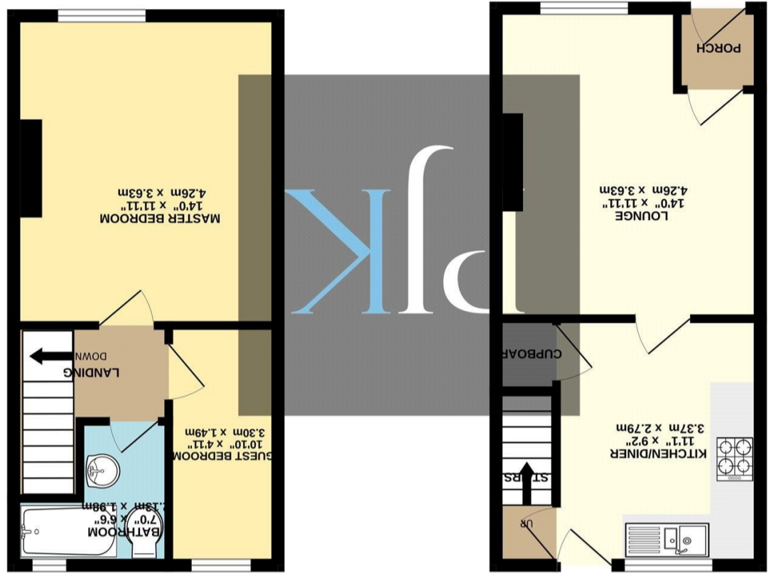
1ST FLOOR 291 sq.ft. (27.0 sq.m.) approx.

TOTAL FLOOR AREA : 586 sq.ft. (54.5 sq.m.) approx. Whilst every attempt has been made to ensure the accuracy of the floorplan contained here, measurements of doors, windows, rooms and other items are approximate and no responsibility is taken for any error, omission or mis-statement. This plan is for illustrative purposes only and should be used as such only. prospective purchaser. The services, systems and appliances shown have not been tested and no guarantee as to their operability or efficiency can be given. Made with Mirograph ©2026